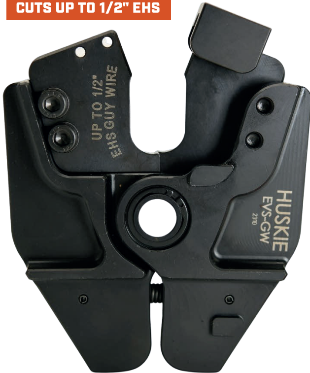
EVS-GWJAW REPLACEMENT BLADE: EVS-GW-B

ALL JAWS MARKED WITH CUTTING CAPACITIES FOR EASY FIELD I.D.