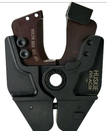
EVS-ACSRJAW REPLACEMENT BLADE: EVS-ACSR-B