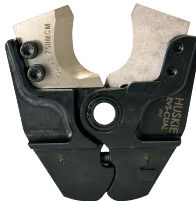
EVS-CUALJAW REPLACEMENT BLADE: EVS-CUAL-B