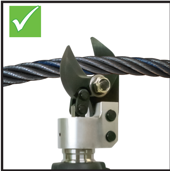
Figure 8A. Correct material placement.