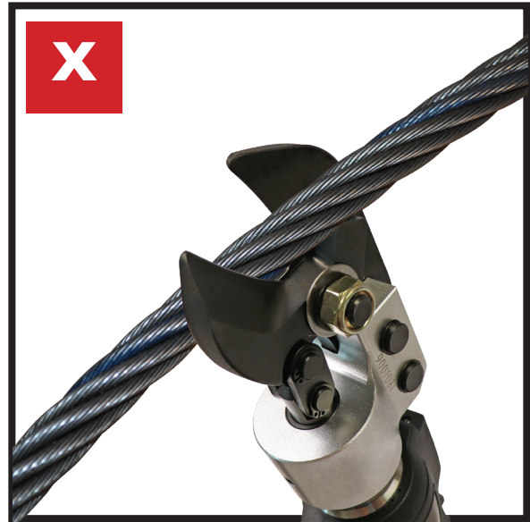
Figure 8B. Incorrect material placement.