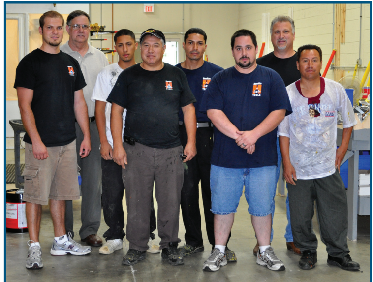
Our Fiberglass Restoration Team

Huskie will match any industry standard color for your fiberglass products.